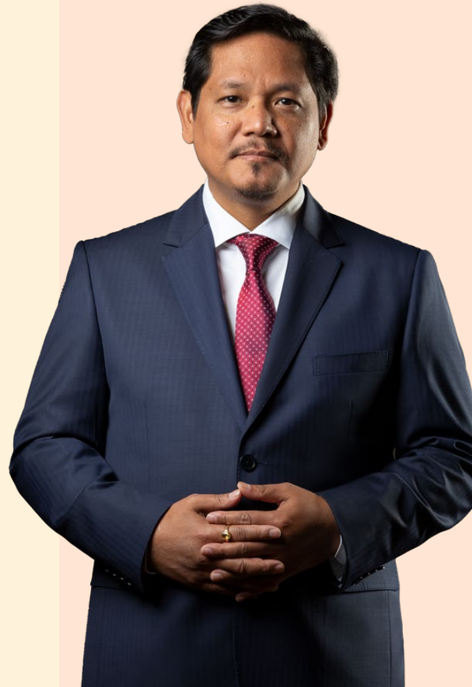
CONRAD K. SANGMA

As we walk this path together, Meghalaya shines as a model to the world. With a call to action that is global, our goal is to prove that a small state, rich in heritage and determination, can play a pivotal role in building a better future - for our people, our nation, and beyond.